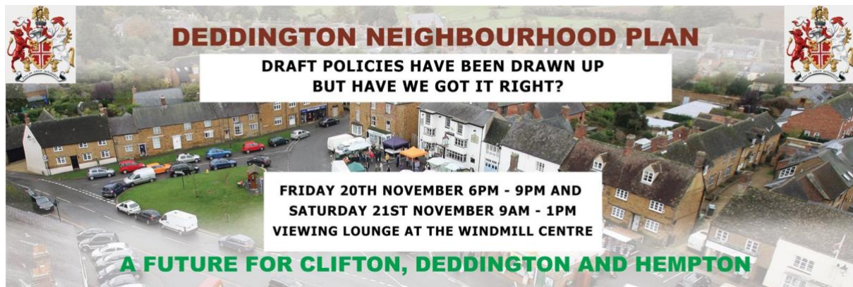
Banner for third 'drop-in' event

Three additional questions were asked to clarify certain of the results of the adult questionnaire concerning downsizing, starter homes and location, which elicited 25 comments to be factored into the development of the Housing policies.